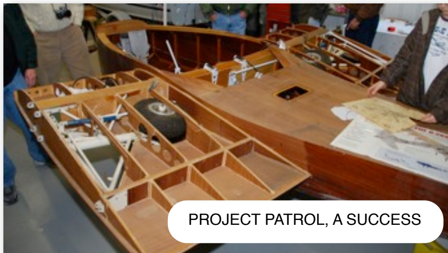
PROJECT PATROL, A SUCCESS